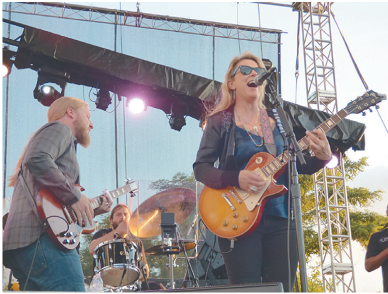
Tedeschi Trucks Band is scheduled to return to Lewiston and perform at Artpark this summer. (File photo)

"Through these challenging times, we remain committed to our mission as a nonprofit orga-